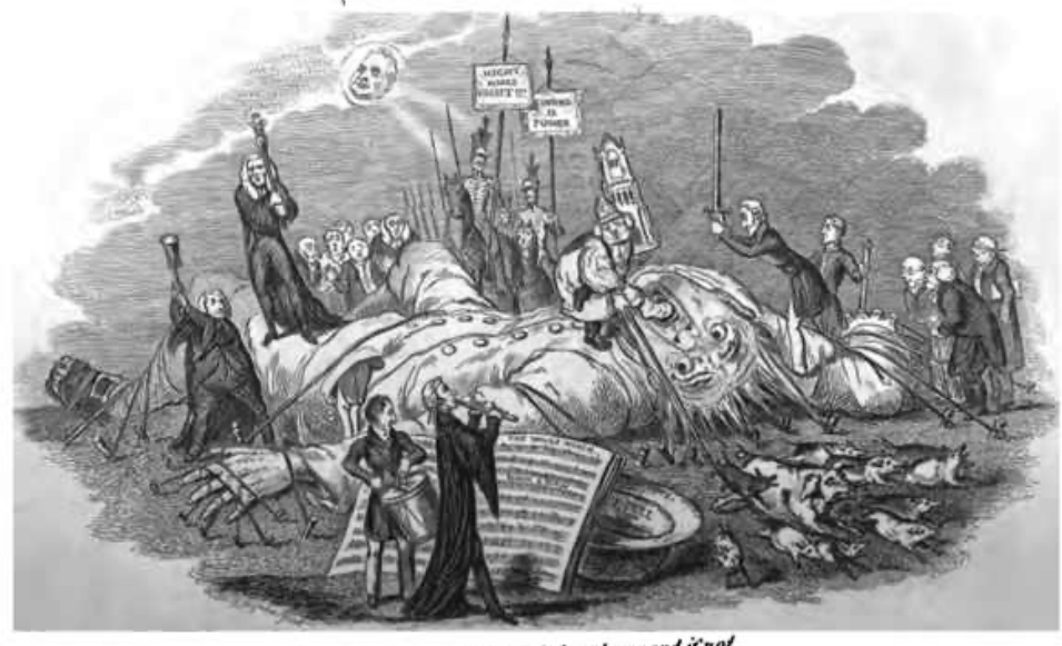
"The People would be quiet is let alone, and it not